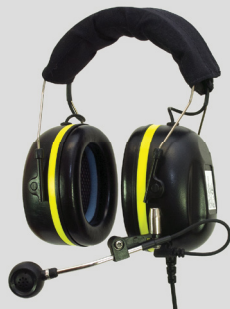
SC-AK5850 Heavy-Duty Headband Headset Helmet Attached version available