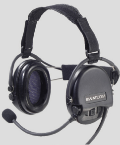
SC76332 Active-Listening Neckband MIL-Spec Headband version available