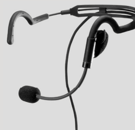
SC8 Lightweight Single Speaker Headset