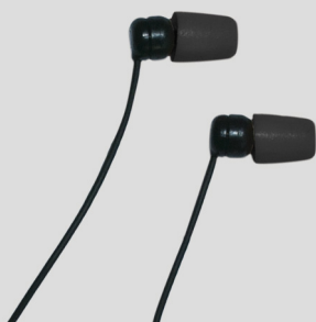
SC30 Lightweight In-Ear Air-Conduction