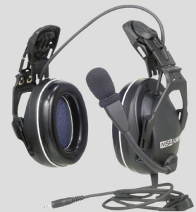
SC41000 Heavy-Duty Helmet-Attached Headset Headband version available