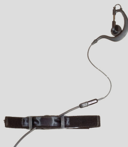
SC5 Throat Mic Optional Ear Hangers