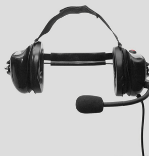
SC95000 Heavy-Duty Neckband Headset